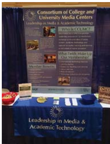
CCUMC Booth, UBTech16 Mirage Las Vegas

Membership renewals were distributed beginning in May. As of June 30th, we have had 139 institutions (237 individuals) and 21 companies (38 individuals) renew their membership. Membership renewal reminders will continue to be distributed through September 2016.